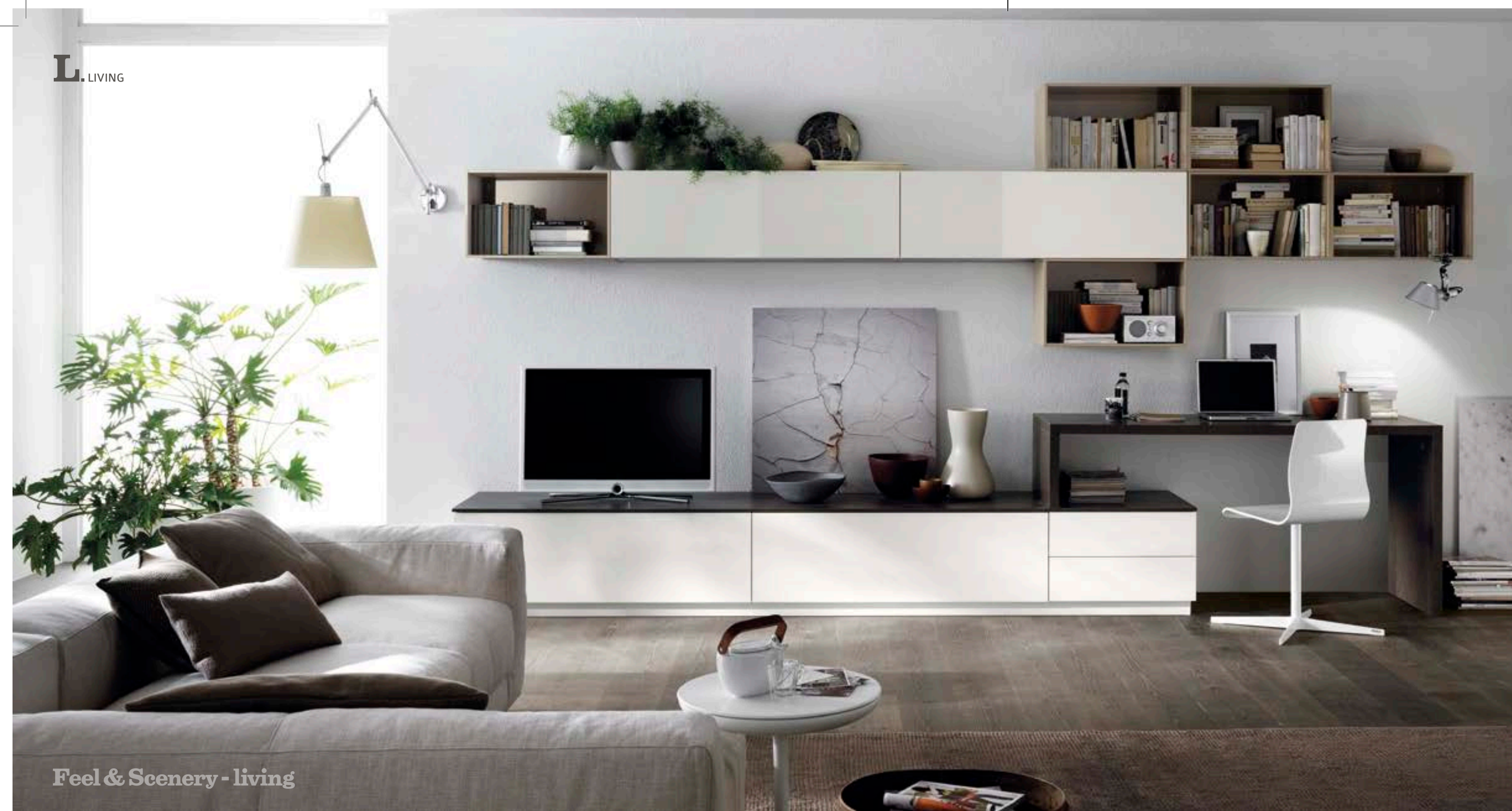
Feel & Scenery - living