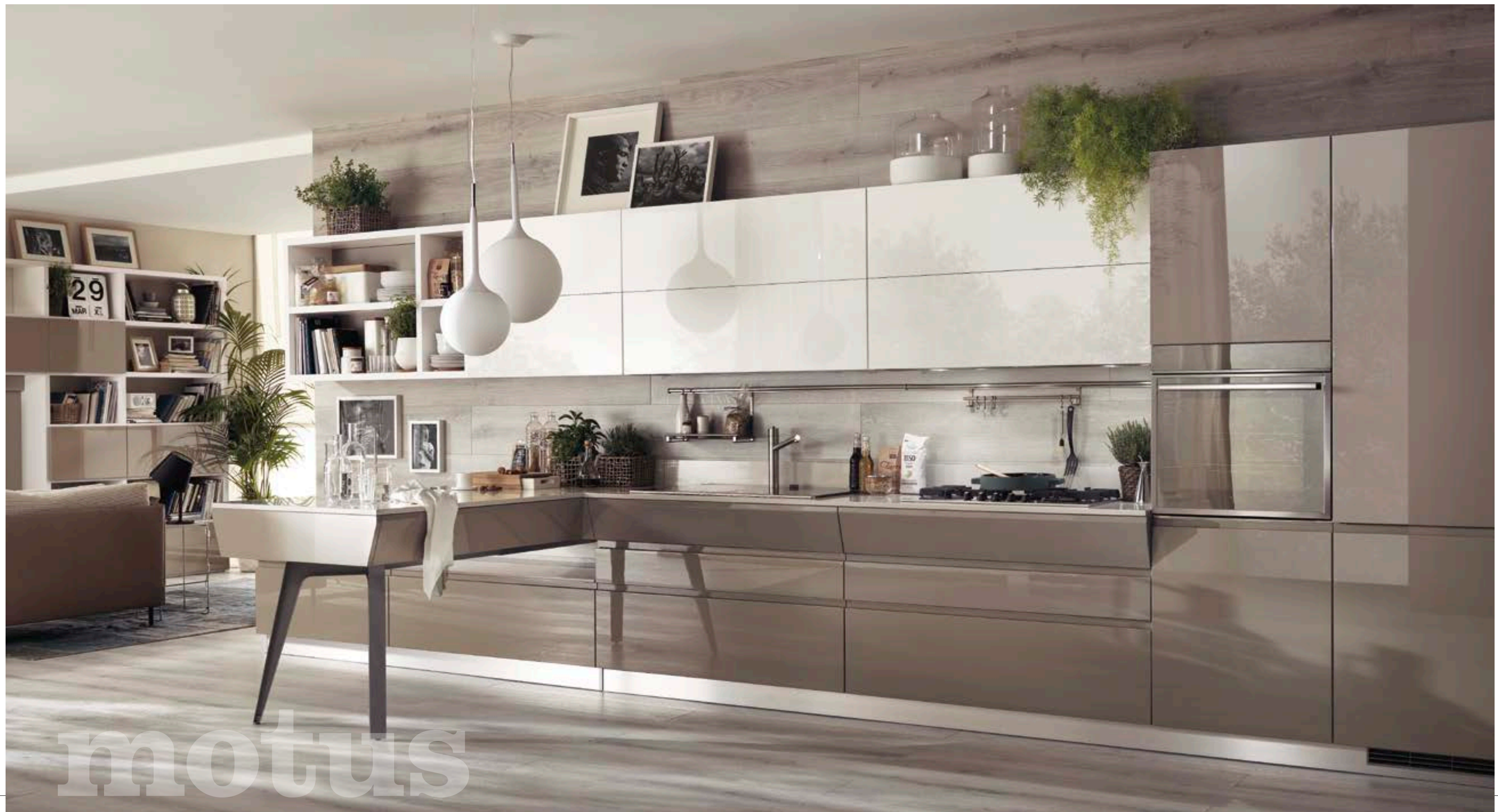
A Motus kitchen is a perfect example of design applied to a project created for modern living and the optimisation of space. Each thickness becomes volume, as depth becomes maximum capacity. The harmony of forms is optimised by the choice of the perfect colour matches: in the composition shown in the photograph, the glossy White lacquer of the wall units and the Tundra Grey of the living doors are brought perfectly together by the matt lacquer Mink back and the Light Beige Okite top.