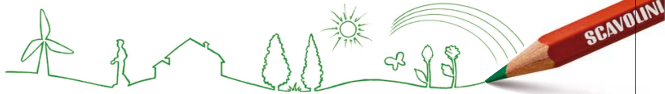
Illustration by Valerio Tizzi

It takes a green mind to imagine a better world.