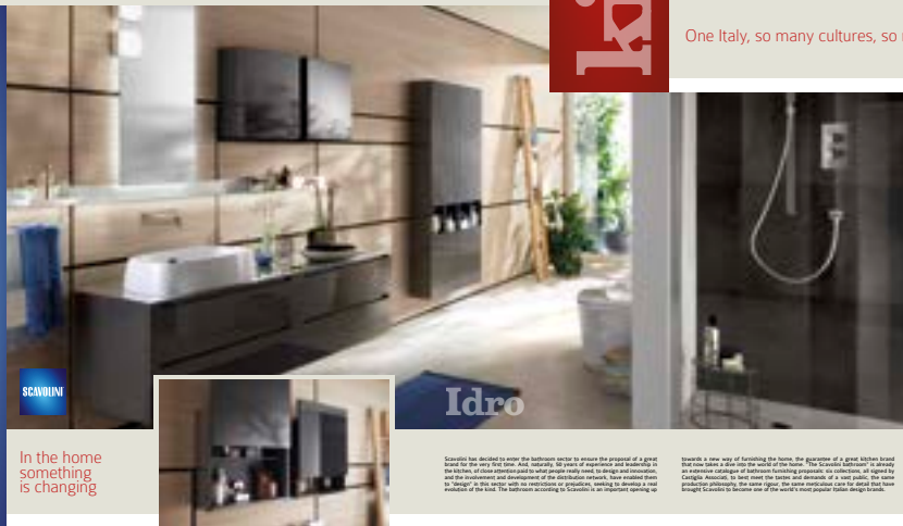
In the home something is changing