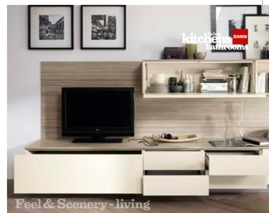
Feel & Scenery - living

Wood, glossy or matt lacquers, glass and aluminium, today Scavolini interprets the living area with ever-different aesthetic solutions: classic or contemporary, measured or surprising, but always created to offer complete, practical solutions with all your Scavolini quality.