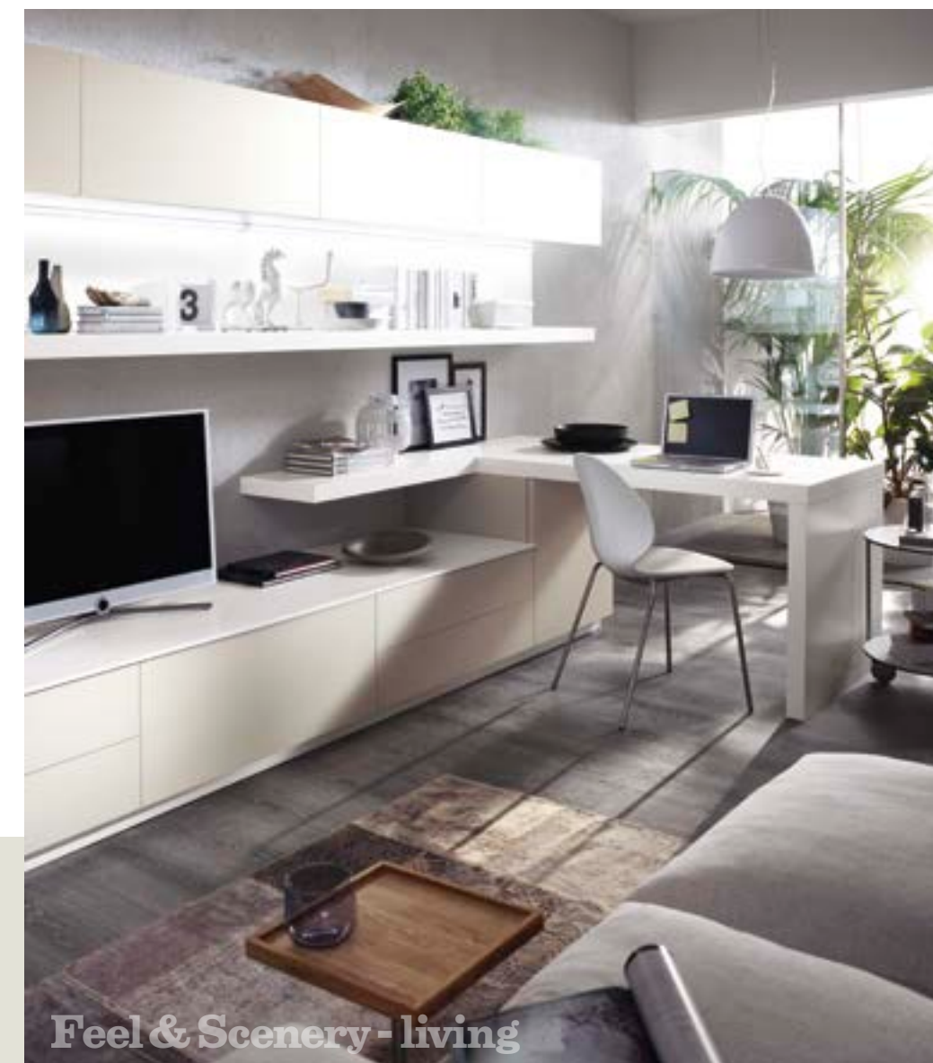
Feel & Scenery - living